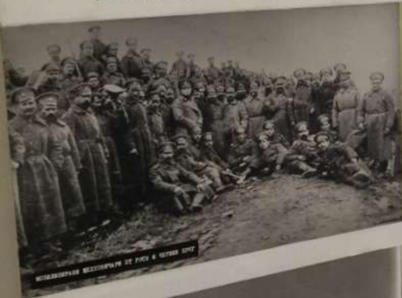
КОМАНДИРАТ НА ЖЕЛЕЗНИЧАРИТЕ ОТ ПЕРВАТА СТУЧКА

В УСЛОВИЯТА НА СЛЕДВОЕННАТА РЕВОЛЮЦИОННА КРИЗА СЕ ЗАСИЛВА БОРБАТА НА ЖЕЛЕЗНИЧАРИ И ПОЩЕНЦИ ЗА ЗАЩИТА НА ТЕХНИТЕ ИНТЕРЕСИ. ВРЪХ НА ТАЗИ БОРБА Е ОБЩАТА СТАЧКА НА ТРАНСПОРТНИТЕ РАБОТНИЦИ, КОЯТО ПРОДЪЛЖАВА 55 ДНИ.