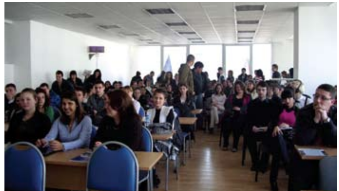
Over 100 students and faculty attended the Fulbright Commission presentation on "The Fulbright Program in Bulgaria and the 2012-2013 Fulbright Grants Competition" at the International University College in Dobrich.