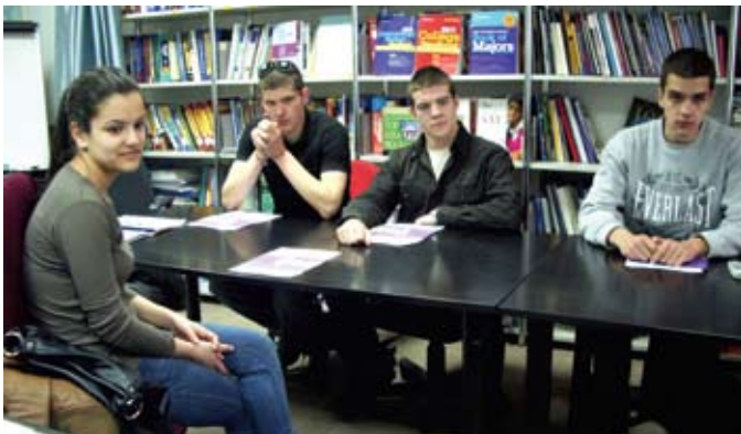
Information session on "Study in the USA" at the Fulbright Advising Center in Sofia.