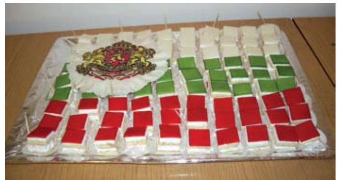
Informal party at the Fulbright Language Training Center in Sofia to mark the Bulgarian National Holiday, March 3 rd .