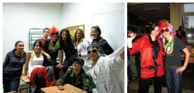
With students during Halloween celebrations at Geo Milev English Language School

But these challenges, whether small or large, have helped me. Life in the city doesn't bother me as much as it once did. And I have to admit, I do take every opportunity to visit the smaller villages and beautiful natural landscapes that are so abundant in Bulgaria. I can fully understand why Bulgarian families flock to the sea and the mountains during their summer holidays. For a person who loves nature, the variety and beauty of Bulgaria is astounding!