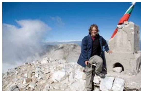
Another victory! Reaching the summit of Mount Vihren in the Pirin Mountains of Bulgaria, September 2009