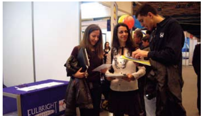
Over 500 students and professionals visited the Fulbright booth at the National Career Fair in Sofia.