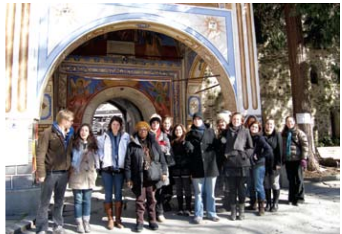
Trip to Rila Monastery