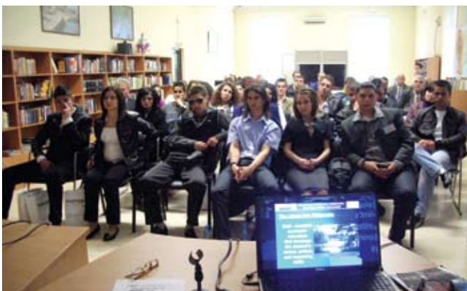
Approximately 100 high school students from all over Bulgaria and children from underrepresented communities attended the Fulbright Commission presentation on "Undergraduate Study in the US" at the American Corner of Sofia City Library.