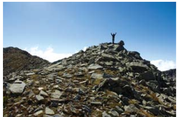
Standing on the Heights. Hiking in the Pirin Mountains of Bulgaria, 2009

When I spoke about American universities at my school in Burgas and asked that those students who plan to study abroad raise their hands, few did. The majority of students expressed both their plans to stay in Bulgaria and their love for their country even with the current challenges. Many of my personal friends in Burgas are of university age. One studied in Sofia. Another recently graduated from the university in Veliko Turnovo with her degree in Russian and English linguistic studies. Another grew up in Burgas and decided to stay at home to attend the local private university. Many of these young people have expressed their desire to stay and make a change in Bulgaria, both in their local communities and on a wider scale. Many talk about whether or not there is hope for the future of Bulgaria. With young people like these, I see hope for Bulgaria. I will hold out hope for this place I have grown to care about so much over the past months. All too soon, I will have to leave. I thank Fulbright and the people of Bulgaria for the experience I have had, and I look forward to the time when I will be able to return to the country whose citizens have been an inspiration to me.