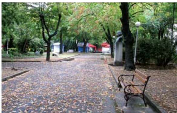
Burgas Sea Garden in the fall