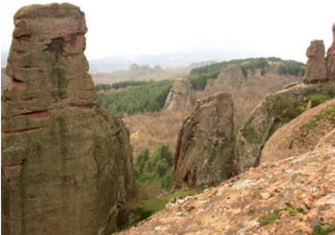
Most recent trip to the Belogradchik Rocks